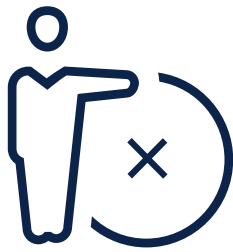
eDisclosure - COI UAccess Analytics