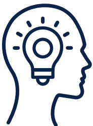
Proposals UAccess Analytics