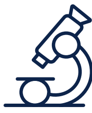
Sponsored Awards & Proposals Interactive Fact Book