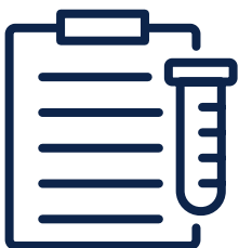
Sponsored Research Profile UAccess Analytics