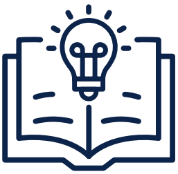
Awards UAccess Analytics

UAIR provides many dashboards to explore research data and leverage insights. UAccess Analytics is the university's internal hub for viewing institutional data. The Interactive Fact Book is a publicly available resource that provides top-level research data in a transparent manner. Click on the icons and start exploring some of the highlighted tools below!