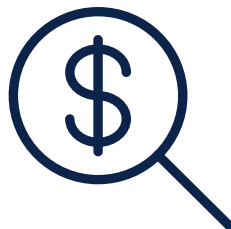
Research & Development Expenditures Interactive Fact Book