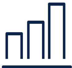
Trending - Proposals UAccess Analytics