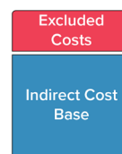
The Indirect Cost Base is calculated by excluding certain costs