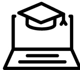
Training & Data Literacy