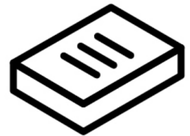
Interactive Fact Book